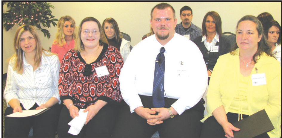
PlugGED In students attend kickoff event