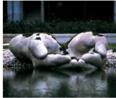
Jackie Brookner, The Gift of Water 2001