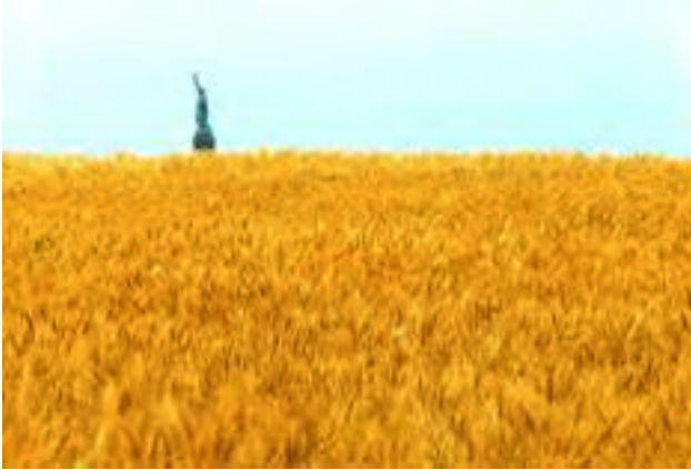
Agnes Denes, "Wheatfield - A Confrontation", Battery Park Landfill, NY, 1982