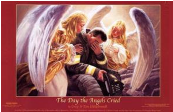
The Day the Angels Cried by Hilderbrandt