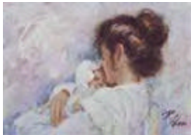
Tender Moment by Zolan