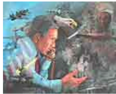
Leslie Hoops-Wallace American Chaos acrylic on canvas, October 2002 16" x 20".