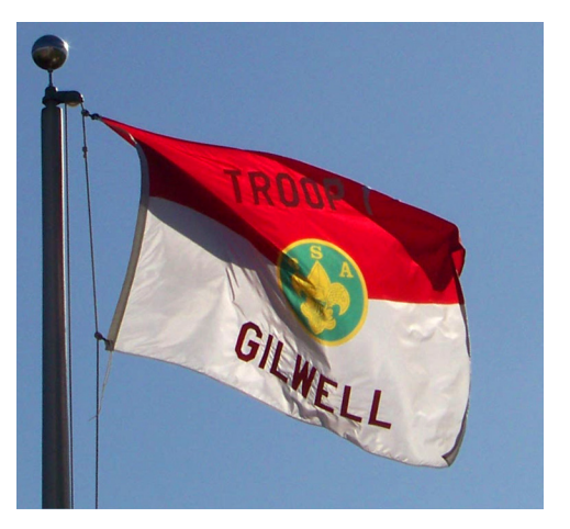
Back to Gilwell—Part Two SR917 continues October 18, 2008 Drive safely!

Your Ticket should be Guided by: Your Personal Values. Your Personal Vision. Your Personal Mission.