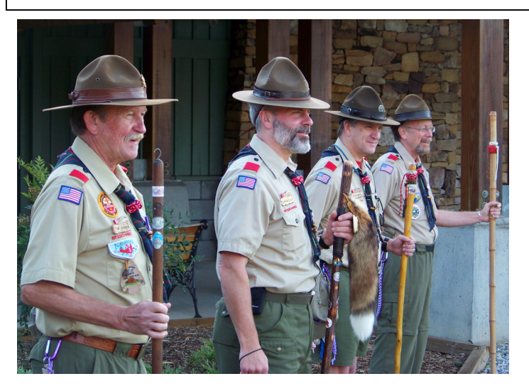
Esteemed Scoutmasters of Gilwell Troop 1 SR 917