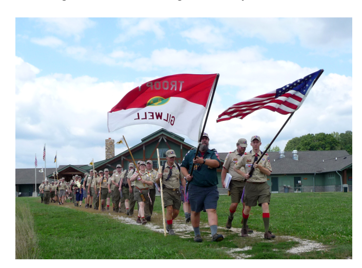
Troop 1 in fine formation!

You might be a Wood Badger if the only decorations on your Christmas tree are the totems you have exchanged at scout training over the years.