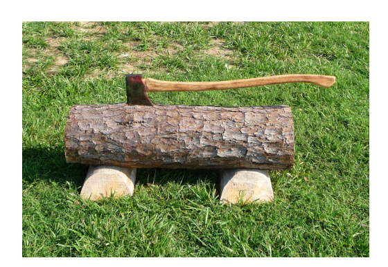
Gilwell Field is officially open!

We settled on a totem, project, team cheer, and more. Hopefully we can pull all of our budding team talents together and pull these off.