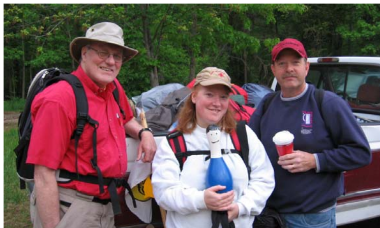
The Start of Another Wood Badge Weekend! (+ Cub?)