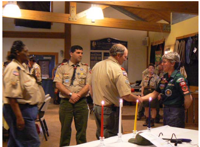
Members of Den 3 cross over and become Eagle Patrol.