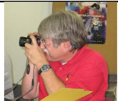
rOWLand and Camera in action.