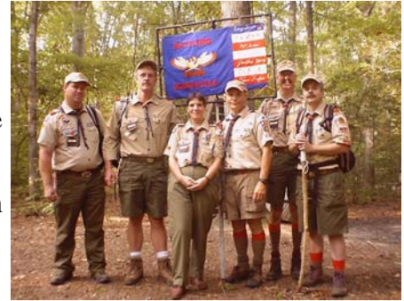
A patrol in Field Uniforms

It seems that some types of shoes are not to be worn. First are the "open toed" ones that tend to lead to "opened-up toed" Scouts. Then there are horse shoes. Our Scoutmaster says: "Whatever shoes are comfortable for you. I might be wearing Crocs most of the time." The "activity uniform" consists of BSA skirts, or culottes, shorts or long pants, BSA web belt, Scout socks, and some type of BSA shirt - with or without a collar. If in doubt - ask a Troop Guide or the Senior Patrol Leader. Salute!