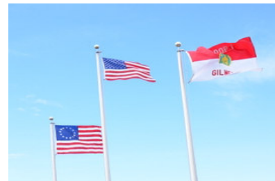
Flags flying high over Gilwell Field

Good planning conserves resources, prevents wasted effort, and saves time and money. Good planning prevents small problems from becoming big problems.