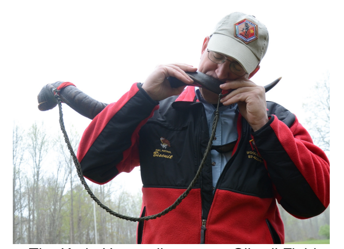
The Kudu Horn calls us onto Gilwell Field