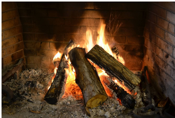
Softly falls the light of day, as our campfire (safely) fades away

Scouting tomorrow will be as different from today as it is from 30 years ago. Together we can create the greatest change in Scouting history and equip future generations of leaders to build upon our legacy.