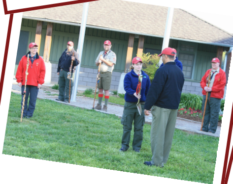
Bear is now Service Patrol