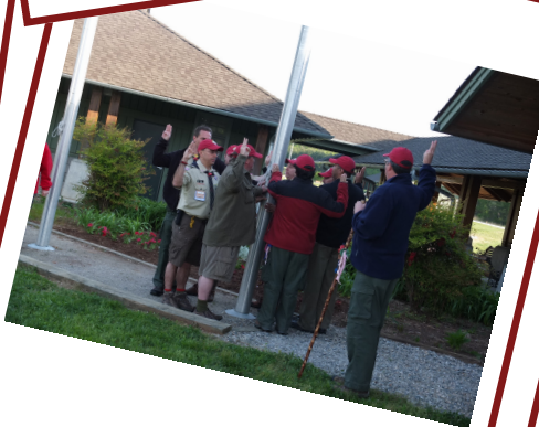
New Patrol Leaders