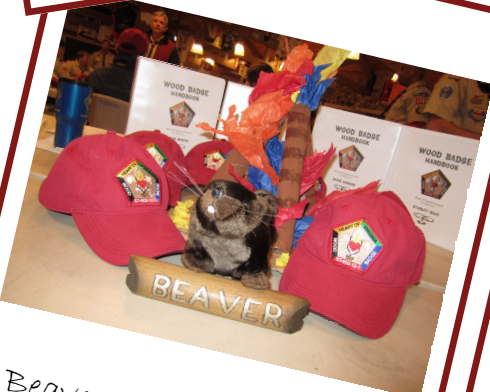
Beaver's keep a neat den