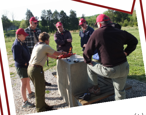
Owls light their stove with mental telepathy