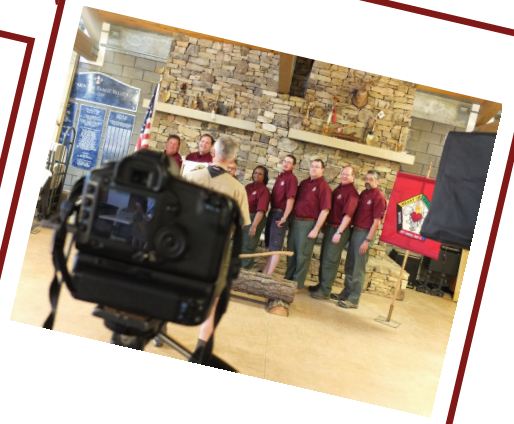
Smile for the camera!