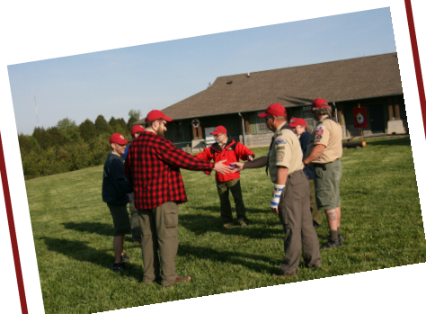
Buffalo gets it done without taking to the air