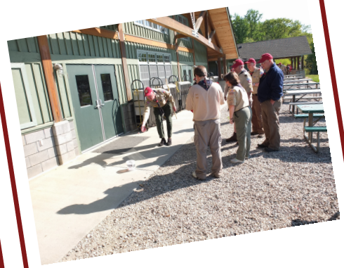
Antelopes toss well