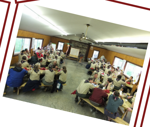
Ready for game show