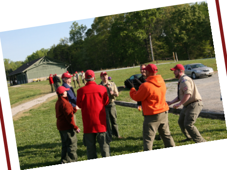
Bobwhites are masters of aerial ball flight