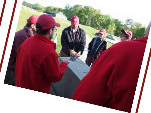
Bears can light a fire