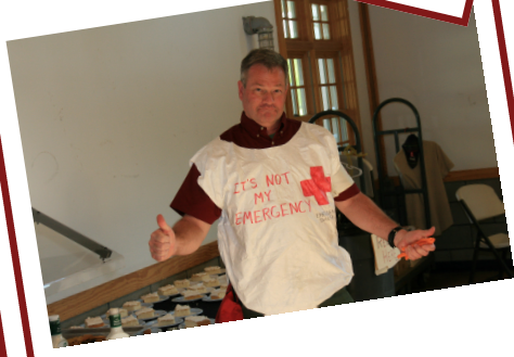
Don't get hurt!