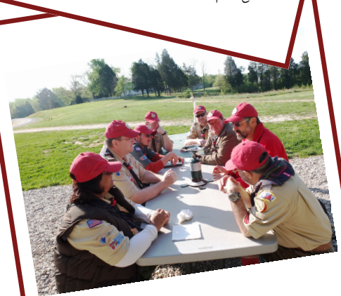
Foxes learning while sunning themselves