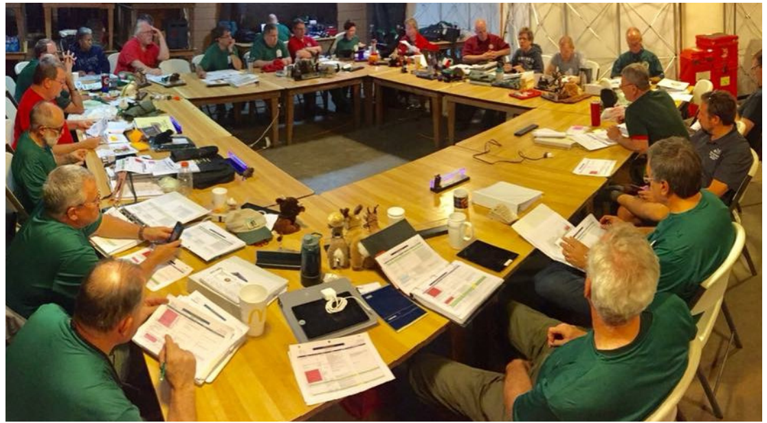
Above: Staff finalizing details for Weekend 2