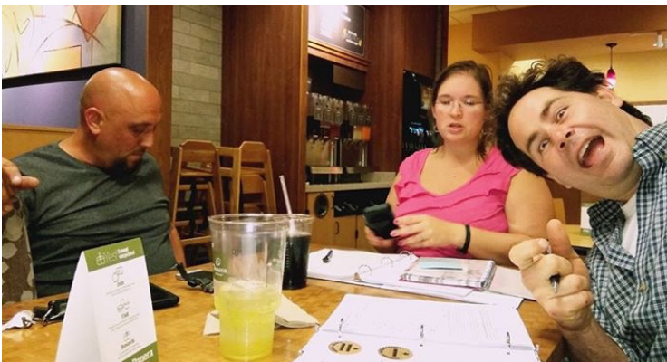
What did the Fox say?