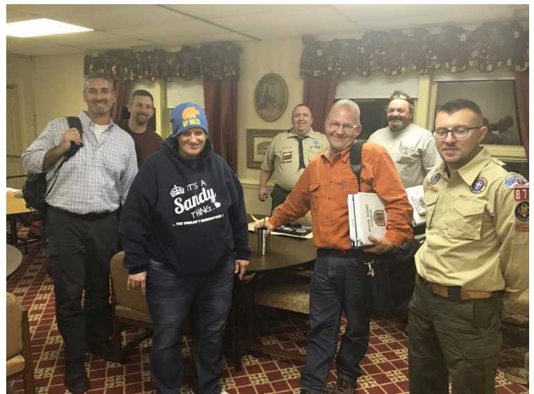
Antelope Patrol ending their night of planning for weekend 2.

We are all so proud to be wearing the WoodBadge S7-602-17 patch on our scout uniforms! Closing with: BACK TO GILWELL I used to be an Antelope, a good o'l Antelope too, But now I've finished Anteloping! I don't know what to do I'm growing old and feeble! And I can Antelope no more, So I'm going to work my ticket if I can! BACK TO GILWELL, HAPPY LAND, I'm going to work my ticket if I can! NOT IF I'M GOING TO WORK MY TICKET!!!!