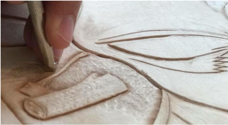
Below: The Antelopes going old school for their flag