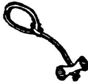
Worn in the button-hole of coat

These sketches by B-P show how the Wood Badge design evolved.