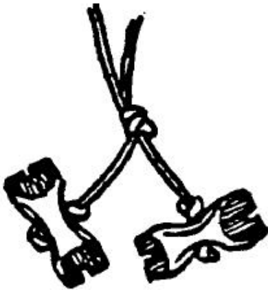
Worn around neck

B-P had got the idea for wearing beads on the hat during the First World War after seeing officers of the U.S. Expeditionary Force wearing broad-brimmed B.P. Stetson hats (not named after Baden-Powell but a Stetson trade name: 'Boss of the Plains') with acorns attached to the two ends of a thong that kept the hat from blowing off the head in a strong wind. He thought originally of having two beads attached in the same way on the Scout hat but changed his mind when it was brought to his attention that Scout Leaders only wore their hats outdoors, so instead he decided that they should be worn on the thong around the neck.