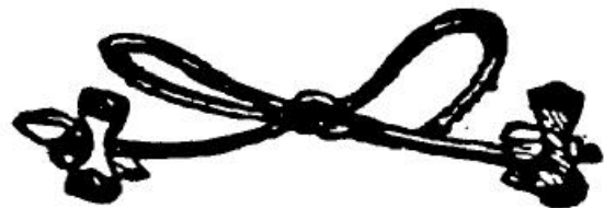
Worn on the brim of Scout hat